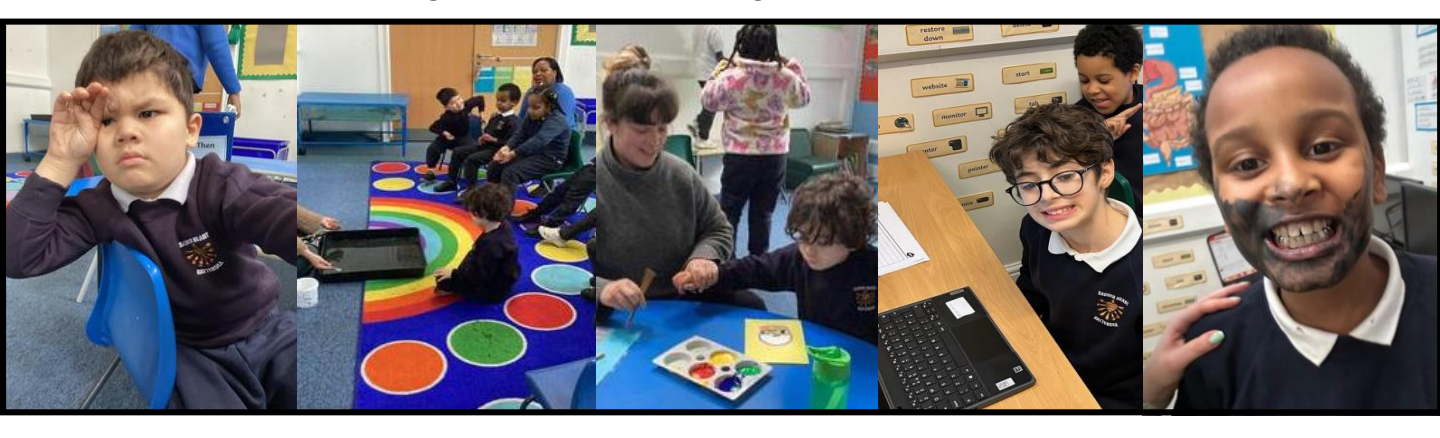
We worked hard on learning new skills in playful and multi-sensory ways.

We have made some amazing artistic creations using our words and our hands.