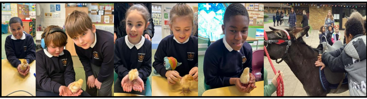
We made memories that will last a lifetime!