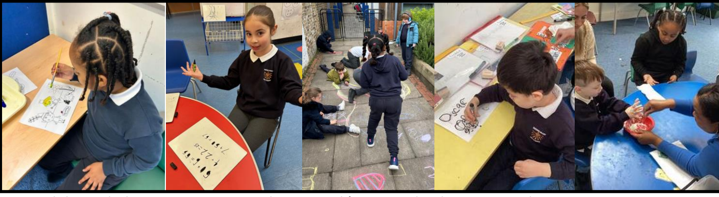
We celebrated Chinese New Year and St. Patrick's Day and Valentines Day!

We develop our fine motor skills and pencil control in lots of different ways.