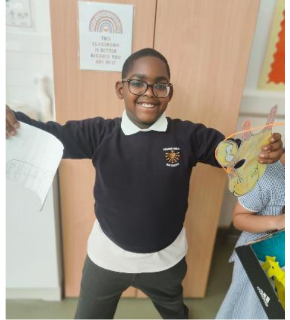
The Great Green Class Bake Off was a huge success!